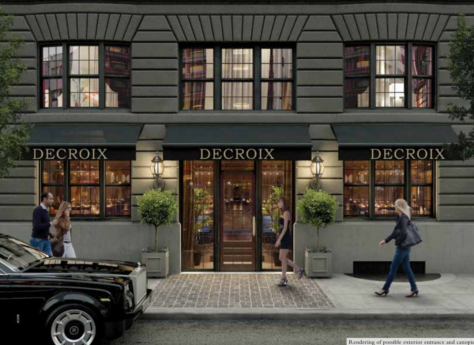
Rendering of possible exterior entrance and canopies.

Eleven EAST 68TH STREET MADISON AVENUE, NEW YORK, NY